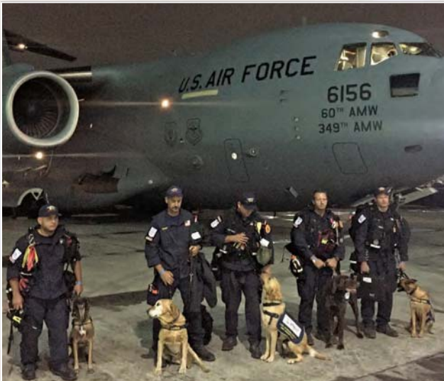
SDF Search Teams with USA-2 leave March Air Force Base for Mexico City.