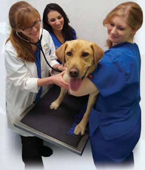
Search Dog Cajun in the caring hands of the staff at Ohana Pet Hospital.