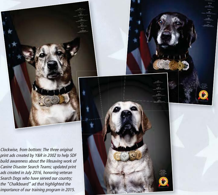
Clockwise, from bottom: The three original print ads created by Y&R in 2002 to help SDF build awareness about the lifesaving work of Canine Disaster Search Teams; updated print ads created in July 2016, honoring veteran Search Dogs who have served our country; the "Chalkboard" ad that highlighted the importance of our training program in 2015.