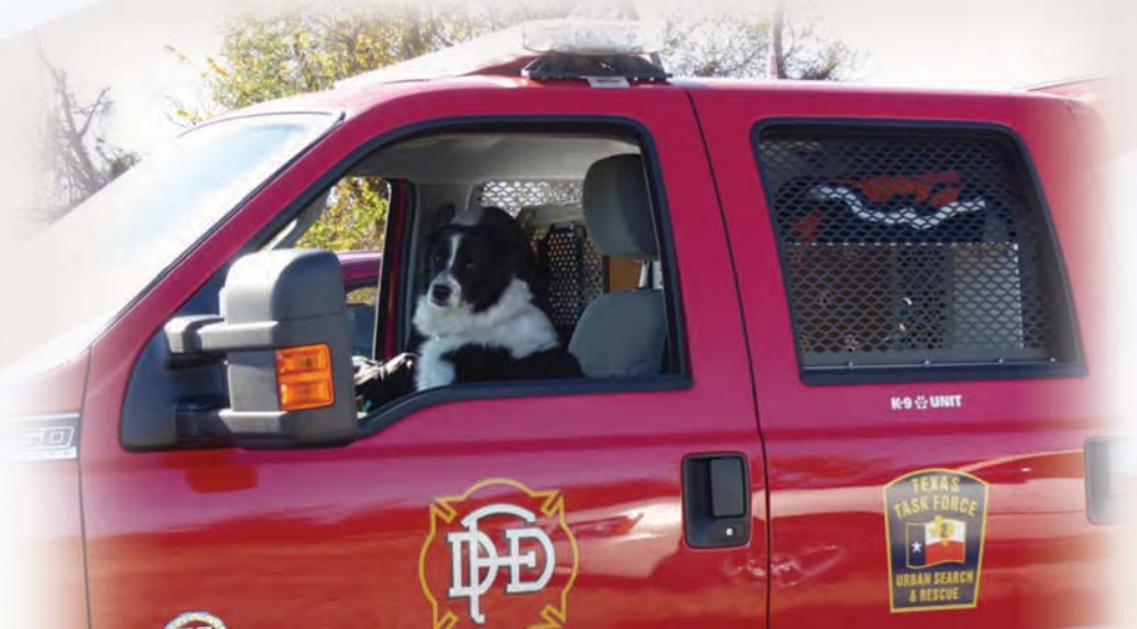
Search Dog Skye is ready to go!