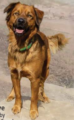
Hawkeye Recruited by Kirsten Fulk from Freedom Service Dog Rescue in Englewood, CO