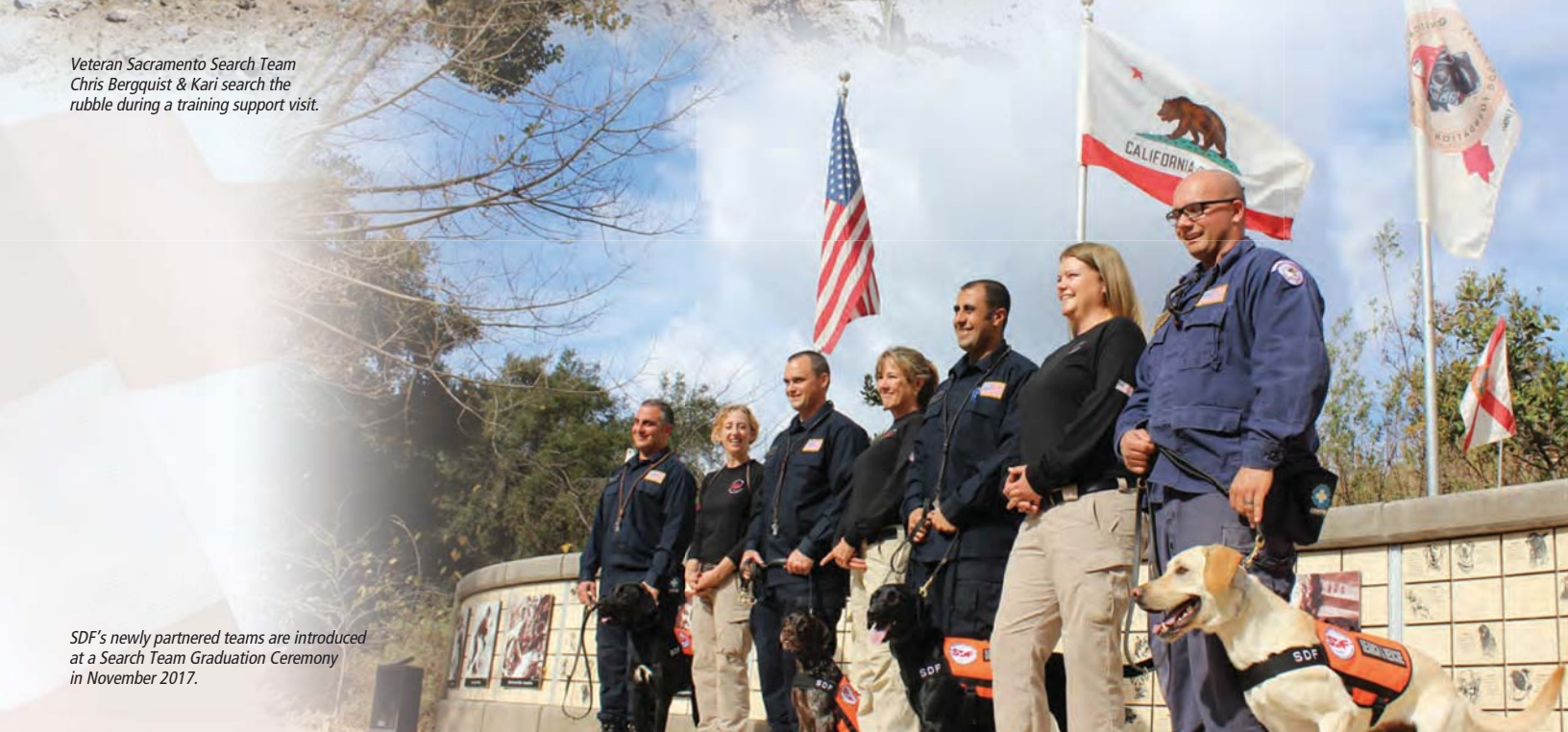
SDF's newly partnered teams are introduced at a Search Team Graduation Ceremony in November 2017.