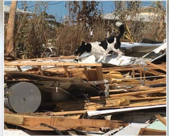
Rocket searching in Florida, following Hurricane Irma.

– Andi Sutcliffe Handler of Search Dog Skye