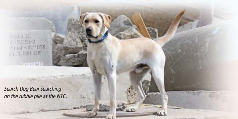
Search Dog Bear searching on the rubble pile at the NTC.